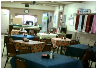
Our kitchen is open from Memorial Day to Labor Day. Menu is posted in the cafe